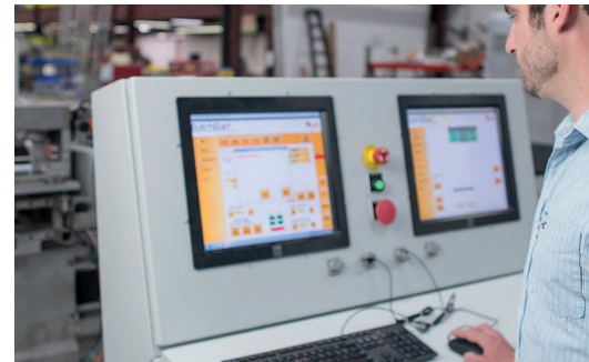
True CNC Control